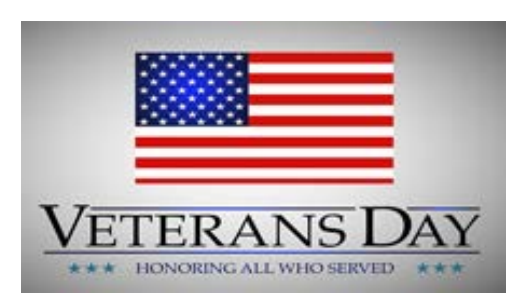
Monday, November 11, 2024